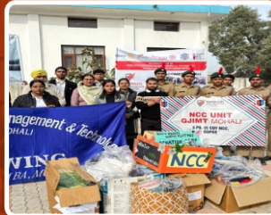
Pre – Placement Training for students within campus