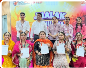
Jhalak Dikhlaa Competition within campus