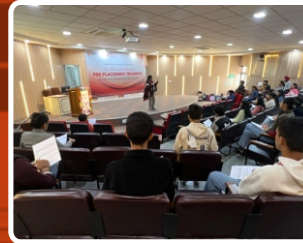
Pre-Placement Training for students within campus