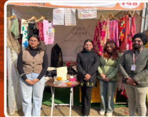
Students participated at Swadeshi Mahotsav 2025 at Panchkula