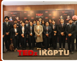
Students participated at TEDx Event at Hotel Park Plaza, Zirakpur