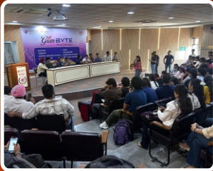
Gian Byte Event within campus