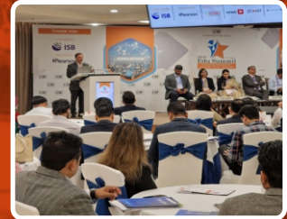
Students participated at Edu Summit, ISB Mohali