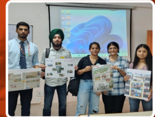
Collage Making Competition during Parakh within campus