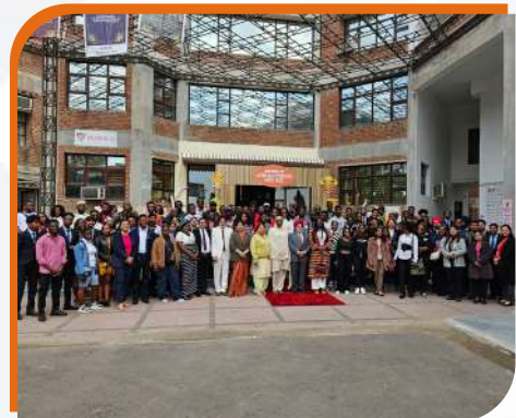
INT'L STUDENTS YEARLY MEET (AFRICAN MEET)