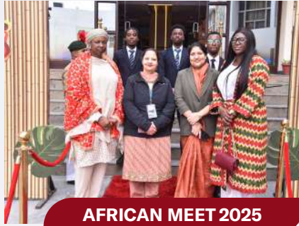
AFRICAN MEET 2025