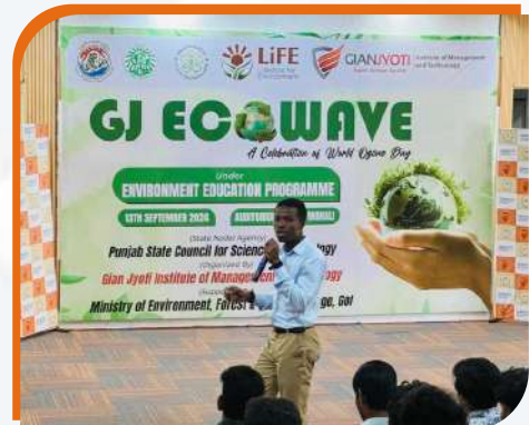
CLUBS AND SOCIETIES