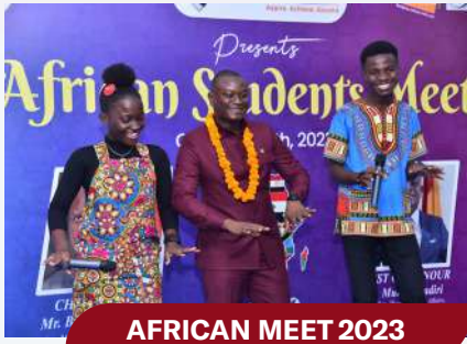
AFRICAN MEET 2023