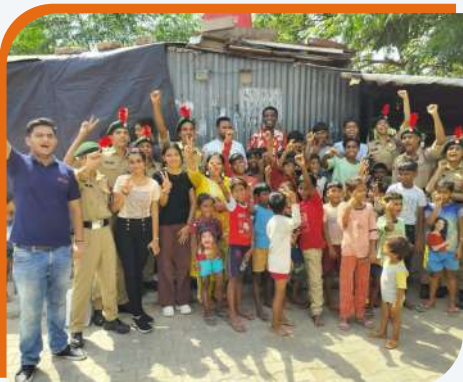
GJIMT VOLUNTEER COMMUNITY -NSS -ROTARACT