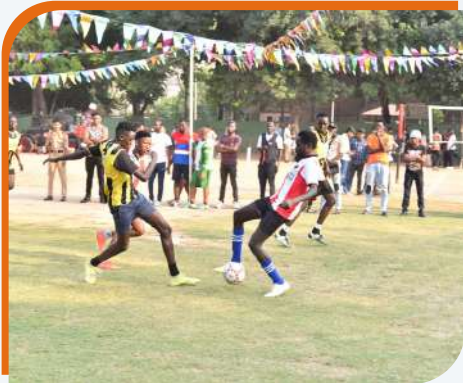
SPORTS AND FITNESS

We want you to have the best possible experience with your studies & enjoy your time at GJIMT.