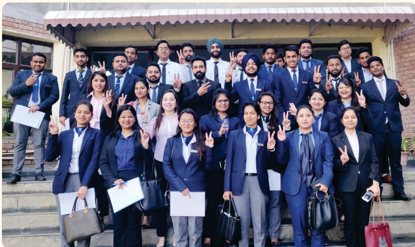
Joint campus placement for students by BRINK'S, an American MNC held at GJIMT.

Dual Specialization offered with combination of two streams in Marketing, Human Resources (HR) and Finance