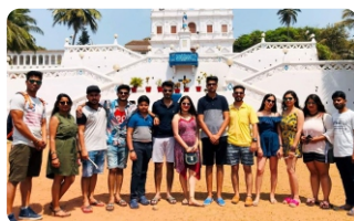
GOA TRIP- LEISURE ACTIVITIES