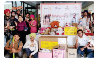
ROTARACT CLUB OF GJIMT