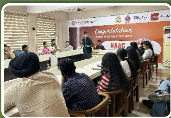
Student Grooming Session