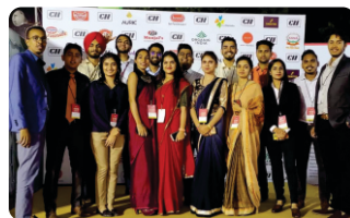
GJIMT STUDENTS AS CII INTERNS