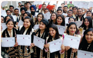
CONVOCATION AT GJIMT