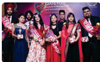
FRESHER'S PARTY AT GJIMT