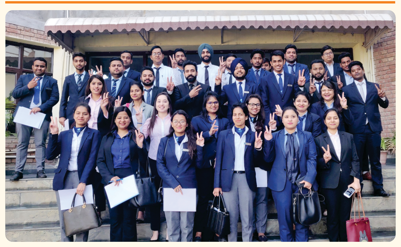
Joint campus placement for students by BRINK'S, an American MNC held at GJIMT.

Dual Specialization offered with combination of two streams in Marketing, Human Resources (HR) and Finance