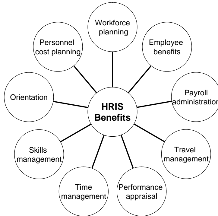
Figure 2: Overall benefits of HRIS

(Krishna and Bhaskar, 2011) summarized the benefits of HRIS as mentioned in Figure 2.